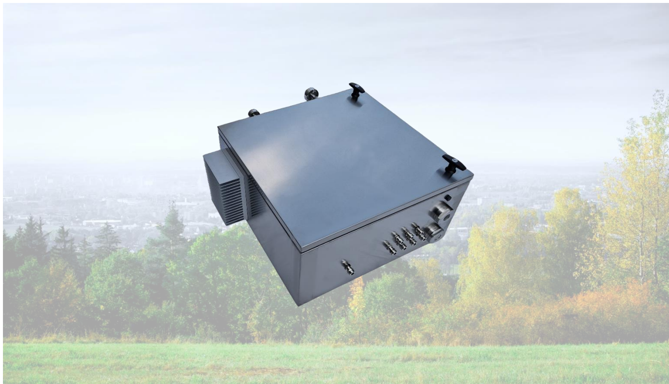
Insight into air pollution