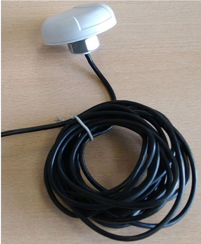
OMC-ANT-G09 Multi-GNSS Receiver