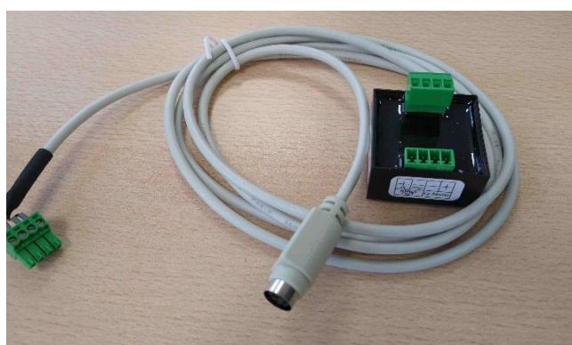
OMC-ANT-G09DC (for connection to a logger)

For connection to an OMC-04x datalogger, this interface kit is needed. It provides the conversion of the 12Vdc output of the logger to the 5Vdc needed by the receiver.