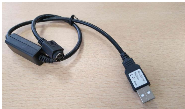
OMC-ANT-G09U (for connection to a PC)

For connection to a USB port of a PC, this short USB cable is needed. This connection is needed if you either want to use the receiver with a PC, or if you need to configure the receiver for a particular application. You will also need to download & install the u-blocks application for this.