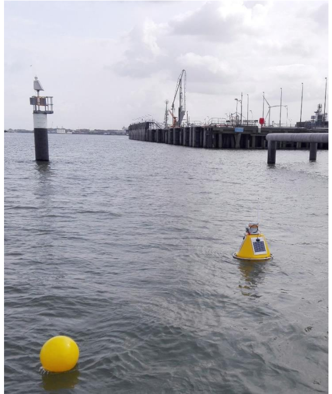
Application of the GNSS receiver in the OMC-7006 data buoy