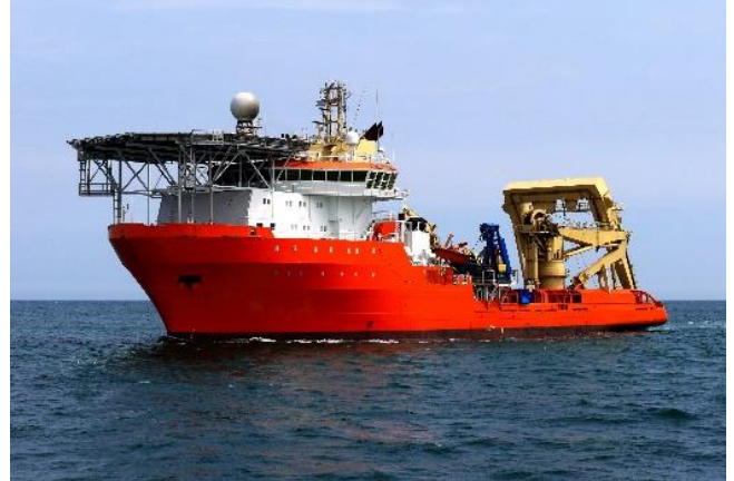
MRU3000 installed in function of an Observator HMS