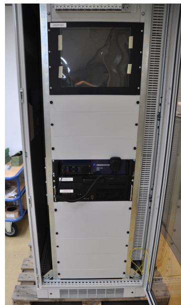
19" Cabinet for weather system