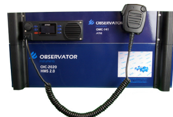
OIC-2020 with OMC-141