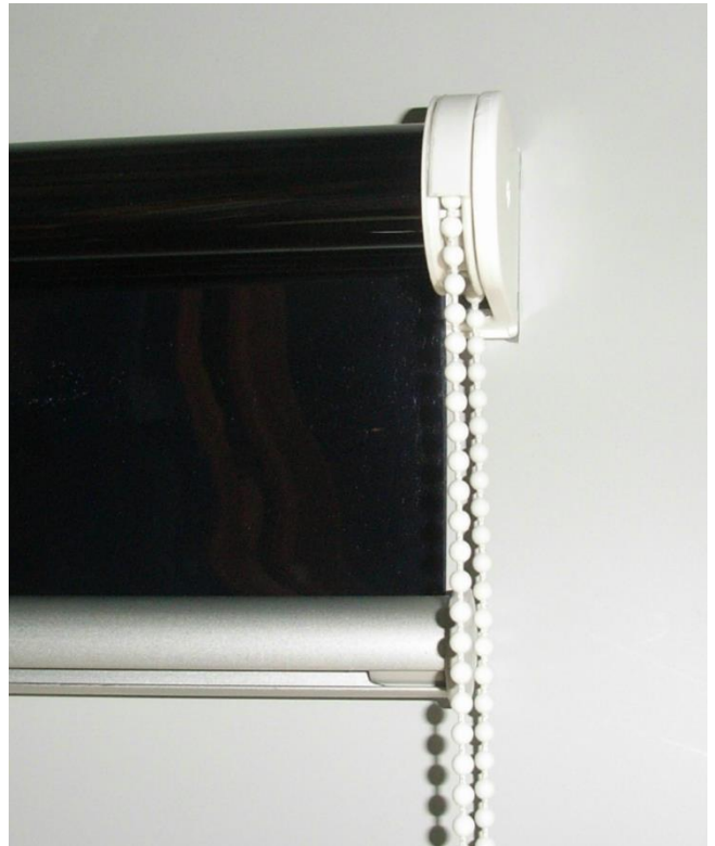
Visi-Plus light with chain guide