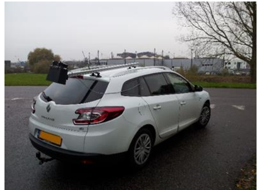
MARWIS mounting options