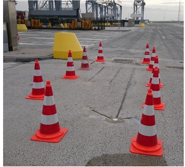
Passive Road Sensor IRS31Pro is flush-mounted in the road

NIRS31 adds to the series of pavement sensors: an intelligent sensor which is part of the pole or part of the bridge surpassing the highway. NIRS31 is a Non invasive road sensor with optical sensors. The sensor is often used on bridges, which do not allow the use of embedded sensors, the NIRS31 is an alternative to the IRS31 Pro. Road sections that need frequent asphalt reconstruction, prefer non-invasive technology as well, to reduce the maintenance costs.