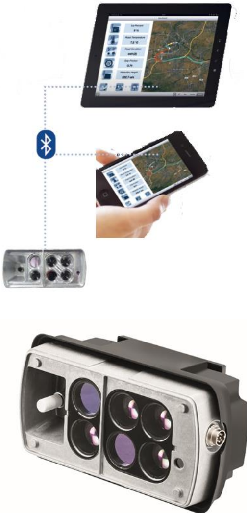
MARWIS - Mobile Road Weather Information Sensor

When the number of ice particles on the road surface increases, the friction coefficient falls and can thus serve as an important element of decision-making with regard to preventive gritting. Due to the open interface protocols, MARWIS can be easily integrated into existing winter maintenance monitoring networks. Similarly, MARWIS can communicate directly with the control system on gritting vehicles. The measurement data output supports the following protocols: UMB binary over CAN bus or Modbus.