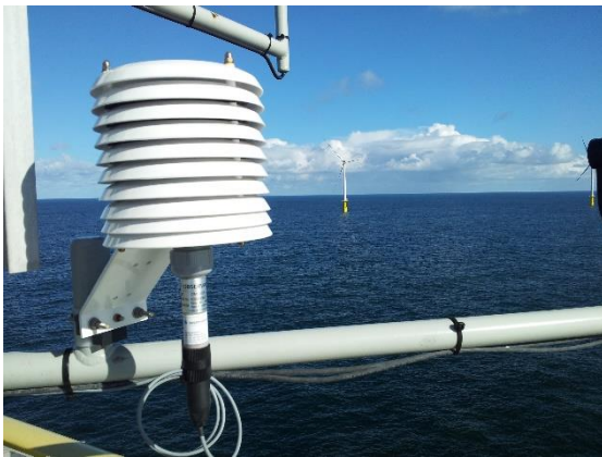
OMC-422 with OMC-406 probe mounted on a pole