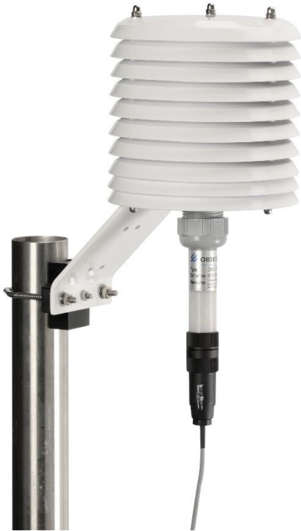
OMC-422 with OMC-406 probe mounted on a pole