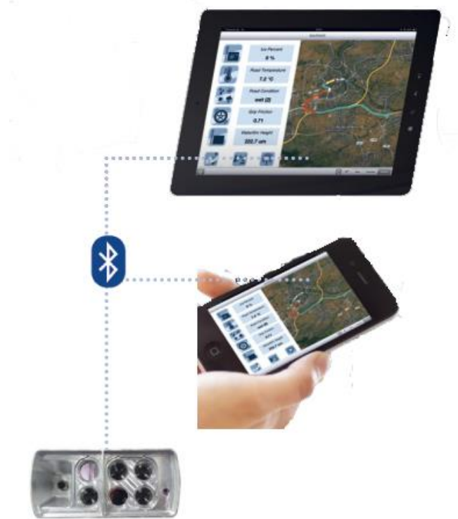
In the vehicle, a tablet or smartphone displays the measurement data graphically in real time