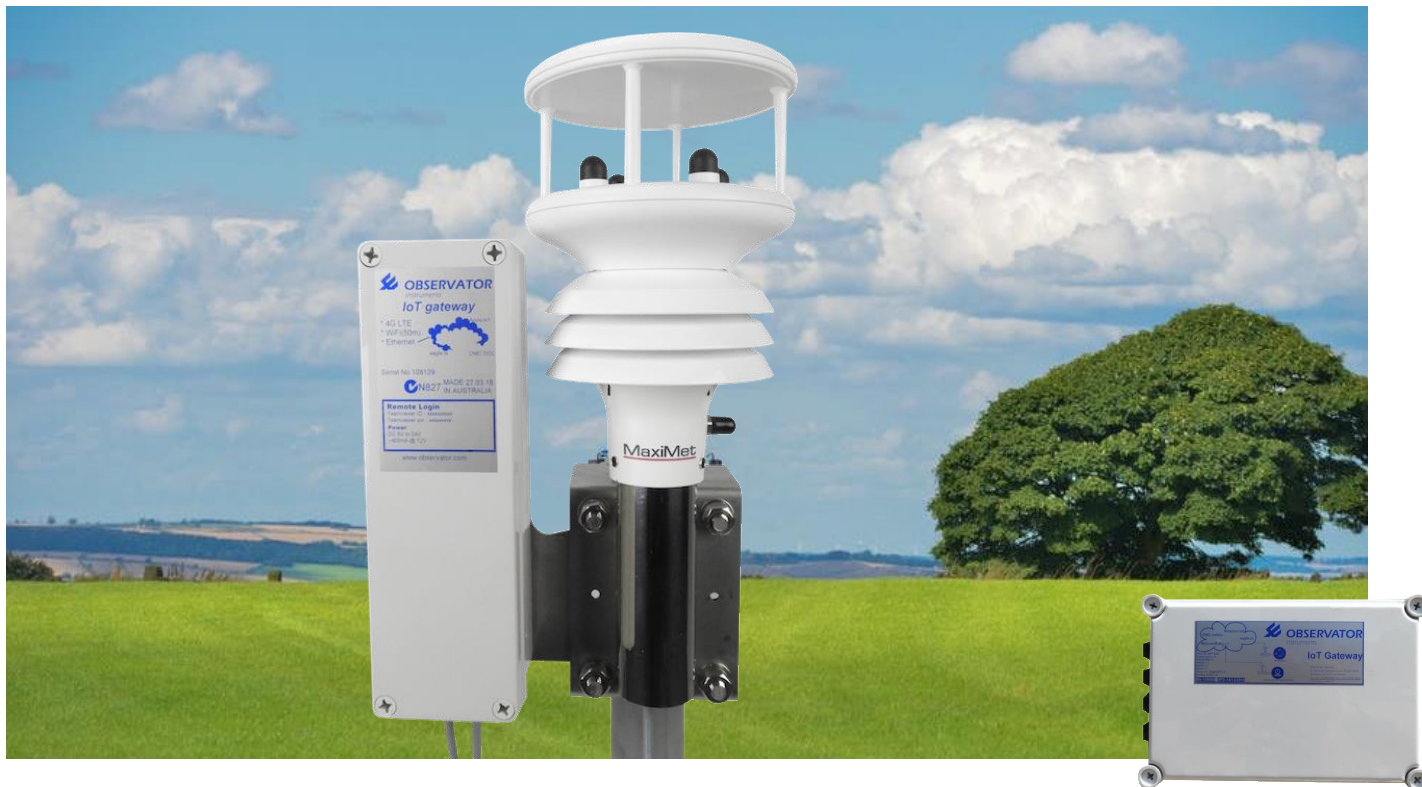
Suitable for data collection – remote control - telemetry systems – real-time data processing