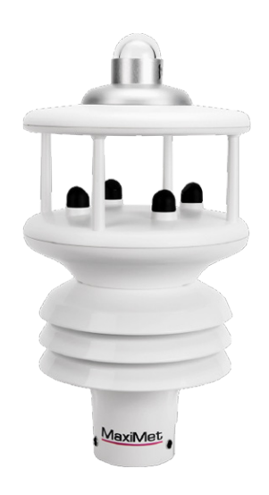
MaxiMet GMX501 measures 6 parameters including solar radiation.